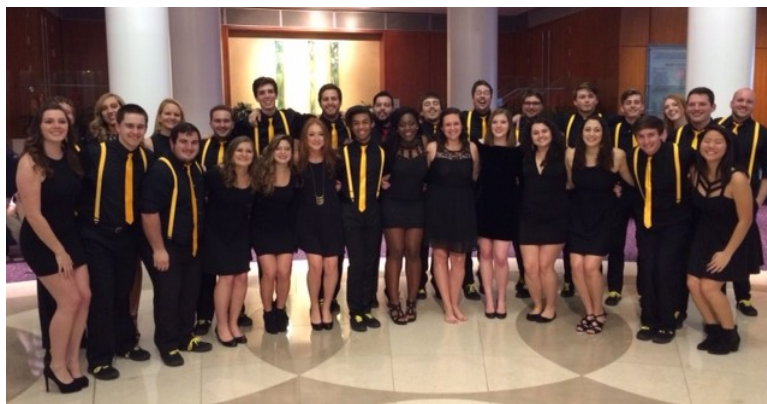
Expansion and Sensations pose post performance . Their joint performance of Sugar left everybody wanting more!

It was the concert that almost wasn't. With an impending snowstorm threatening to keep our performers snowed in at universities scattered throughout Virginia, WOASF was forced to look at some alternatives. Fortunately, our wonderful concert hall was available the very next weekend as were the Sensations, the all female a cappella group from Virginia Tech. Unfortunately, our go to guys, the Hullabahoos from UVA couldn't make it, which set us on a scramble to fill the void. Fortunately for us, Expansion from Christopher Newport University were willing and able to help us out and they were awesome!