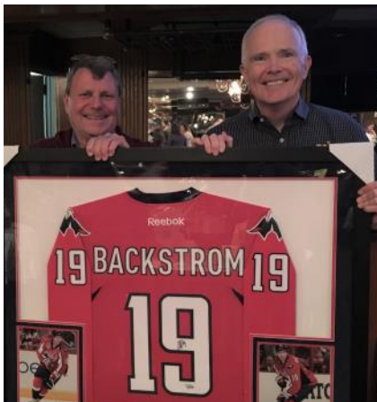
An amazing donation from Fanatics!

The annual Basket Bonanza was a huge success through the generosity of all the participants. With over 50 baskets, incredible live auction items with bids coming over the phone and a record-breaking $15,800 Paddle Raise, there was no shortage of fun and camaraderie as money was raised for scholarships! Thanks to our incredible volunteers and donors, the Basket Bonanza was our largest East Coast fundraiser.