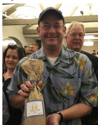
Everyone's a Winner at the Wine Wall!