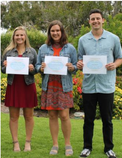
2019 Scholarship Recipients at the West Coast Reception

We celebrated our scholars and their incredible achievements with scholarship awards receptions on both coasts. Recipients and their parents were able to meet the WOASF supporters—donors, volunteers, and board members—who give so much to the foundation and share their stories and plans for the future. It was an opportunity for relationship building that we hope will carry them through the years as they pursue their studies. As with every year, the task of selecting the recipients out of over 200 applicants whose academic and extra-curricular resumes were ALL outstanding was challenging. Our selection committee, made up of volunteers from the Naval Aviation community, had a difficult task, but they navigated our blind selection process beautifully. The 2019 scholarship recipients truly represent the BEST the Navy has to offer. With not only four-year college scholarships available but also scholarships for 2-year community colleges and trade schools, WOASF aims to provide the most options for our Navy dependents to help them reach their educational goals. The scholars we help today are our doers and thinkers of tomorrow. They are the engineers, scientists, teachers, actors, doctors and leaders of the future. WOASF scholars leave