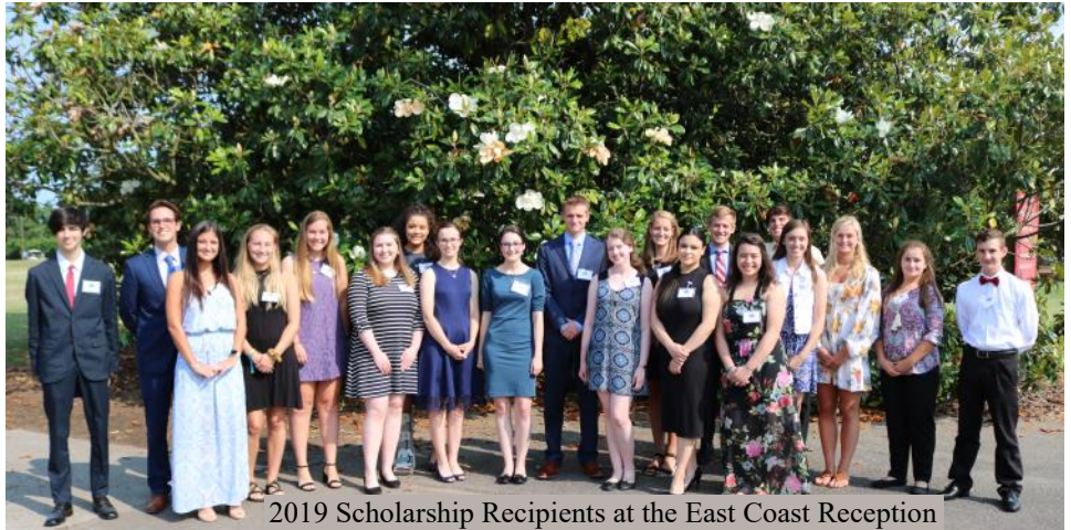
2019 Scholarship Recipients at the East Coast Reception