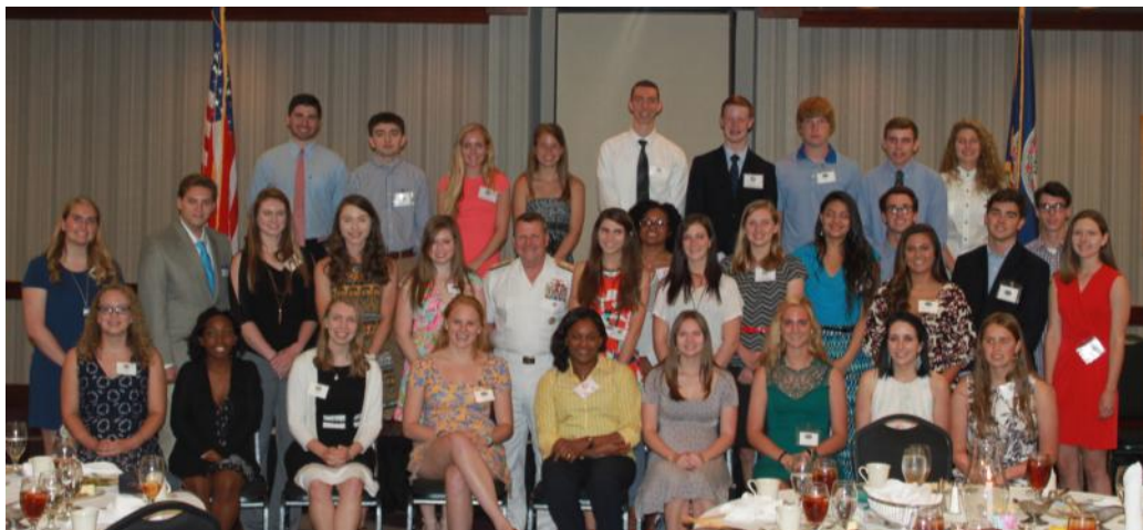
Scholar recipients with guest speaker, Admiral Bill Gortney at the East Coast Reception.

Each year we talk about how our foundation is growing and fortunately, 2016 has been another great year for WOASF. Not only did we award more scholarships for more money than ever before, we continue to bring on administered scholarships totaling an additional 30 scholarships for our Navy families. This brings our total awards to 85 for over $202,000! It is through the tireless work of our board and