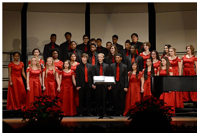
Vox Harmonia from the Visual and Performing Arts Academy at Salem High School

But the Hullabahoos weren’t the only group to perform. The show was started by Vox Harmonia, from the Visual and Performing Arts Academy at Salem High School. The mixed a cappella group performed the National Anthem as well as Run to You and Bring Him Home . Adding depth to the evening’s performance were the Darlin’ Marlins from Bayside High School. This all female a cappella group (with one male percussionist), opened the second act with Sweet Dreams and You’re Gonna Miss Me in Paradise Mash . There were many Navy dependents singing in the high school groups, so perhaps one day, they will be WOASF scholars too.