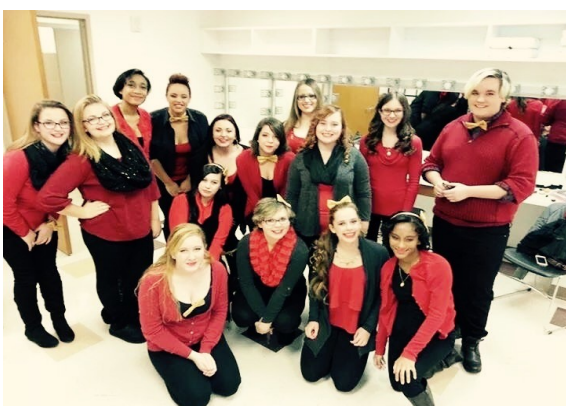
The Darlin’ Marlins of Bayside High School