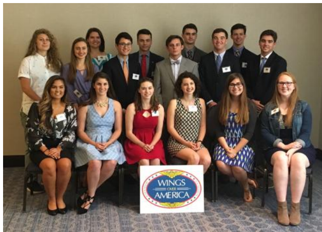
2017 Scholar recipients at the East Coast Reception.

“As a recent graduate, I wish to thank Wings Over America Scholarship Foundation for your continuous support and encouragement throughout my undergraduate education at Swarthmore College, where I received my BA in Linguistics with high honors and dual minors in Cognitive Science and Psychology.