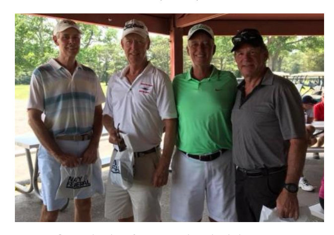
Our winning foursome in Virginia Beach.