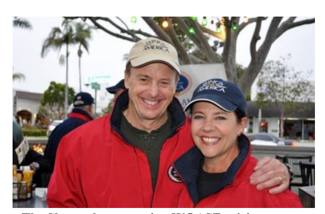
The Shoemakers sporting WOASF spirit wear at happy hour.